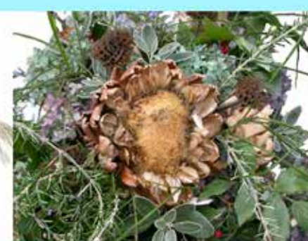
and eccentric effigies....