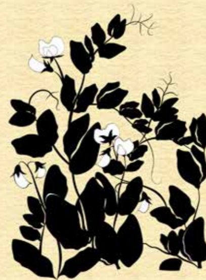
Sweet peas by Sarah